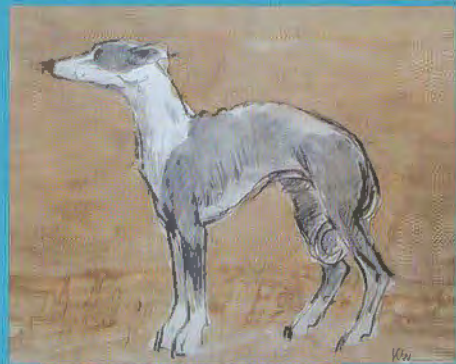
Kyffin Williams Whippet